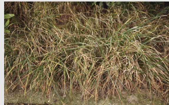
Dying mondograss cause by Pythium root rot