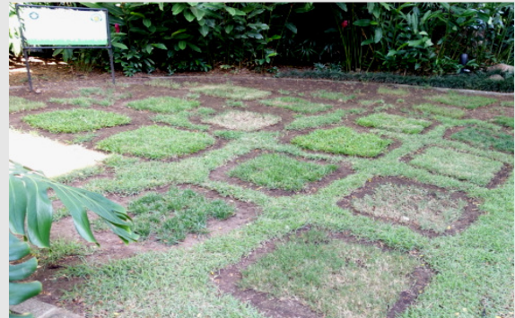
Evaluation of turfgrasses for shade tolerance

Meet at the Times Supermarket parking lot (3350 Honoapiilani Rd., Lahaina) at 8:45 am to carpool to the Mahana