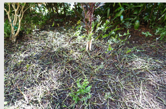
Decline of lauae fern caused by weevil damage

You can register by responding to this email ( nagatan@ctahr.hawaii.edu ) or by calling the Cooperative Extension Service at 244-3242 x230 and providing your name, company & telephone number (should we need to contact you of any changes to this event).